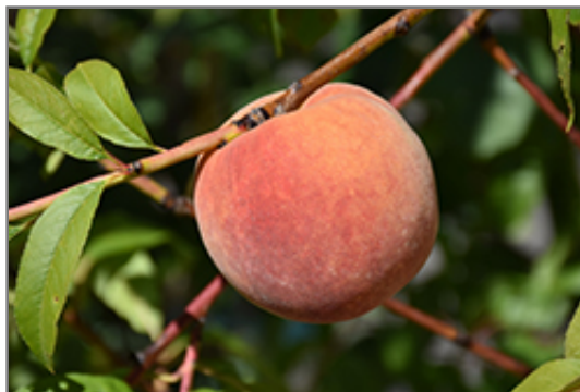
Redhaven Peach fruit

Redhaven Peach is covered in stunning clusters of fragrant pink flowers along the branches in early spring, which emerge from distinctive rose flower buds before the leaves. It has dark green deciduous foliage. The narrow leaves turn yellow in fall. The fruits are showy yellow drupes with a red blush, which are carried in abundance in mid summer. The fruit can be messy if allowed to drop on the lawn or walkways, and may require occasional clean-up.