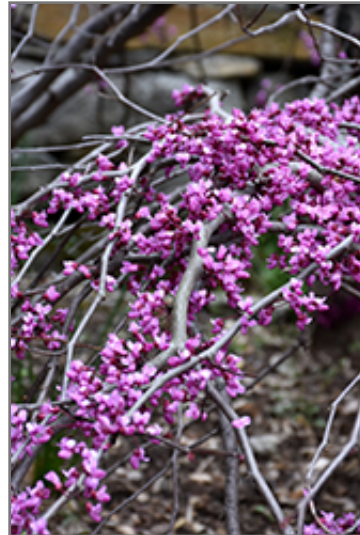
Ruby Falls Redbud flowers