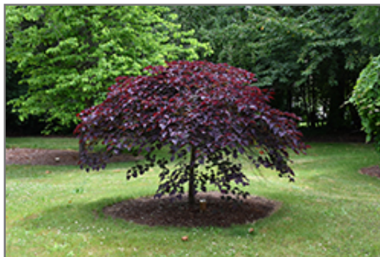
Ruby Falls Redbud

Ruby Falls Redbud will grow to be about 8 feet tall at maturity, with a spread of 6 feet. It has a low canopy with a typical clearance of 1 foot from the ground, and is suitable for planting under power lines. It grows at a medium rate, and under ideal conditions can be expected to live for 60 years or more.