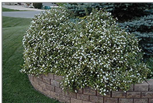
Abbotswood Potentilla in bloom