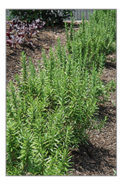
Spice Islands Rosemary

Spice Islands Rosemary will grow to be about 6 feet tall at maturity, with a spread of 4 feet. Although it's not a true annual, this plant can be expected to behave as an annual in our climate if left outdoors over the winter, usually needing replacement the following year. As such, gardeners should take into consideration that it will perform differently than it would in its native habitat.