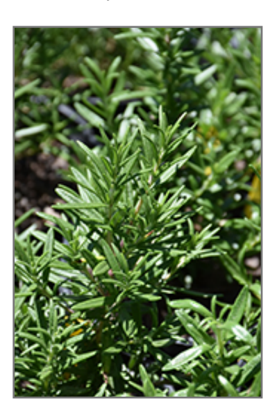
Spice Islands Rosemary foliage