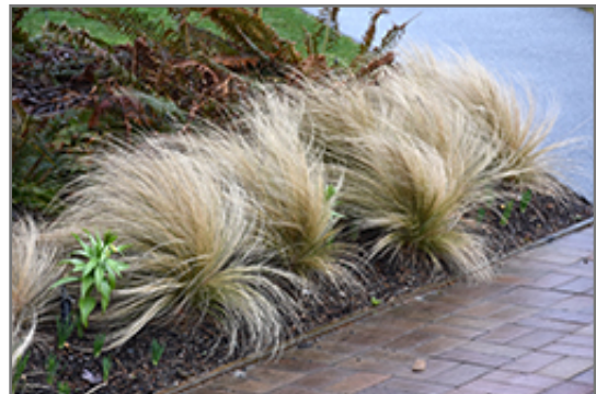
Mexican Feather Grass