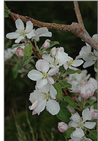
Pink Lady Apple flowers