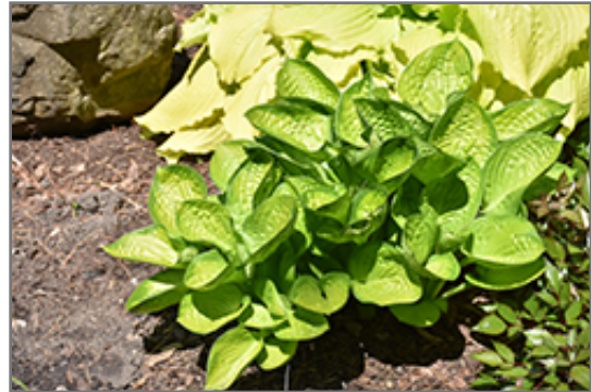
Rainforest Sunrise Hosta