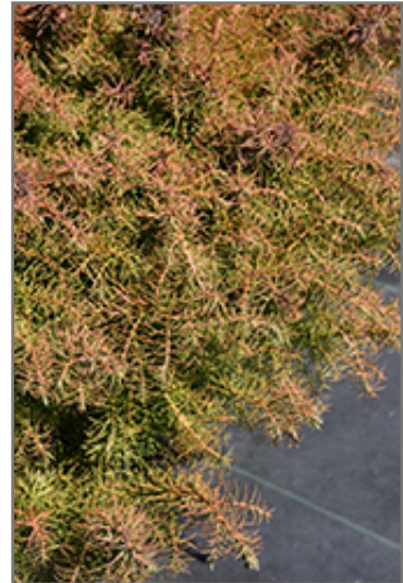
Mushroom Japanese Cedar foliage