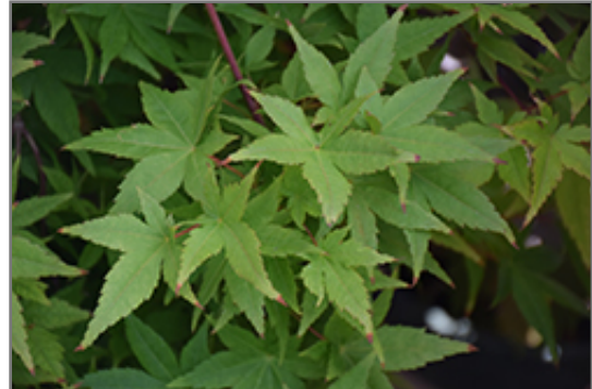
Ryusen Japanese Maple foliage