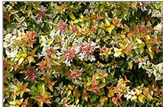
Kaleidoscope Abelia flowers

This shrub will require occasional maintenance and upkeep, and should only be pruned after flowering to avoid removing any of the current season's flowers. It is a good choice for attracting birds, bees and butterflies to your yard, but is not particularly attractive to deer who tend to leave it alone in favor of tastier treats. It has no significant negative characteristics.