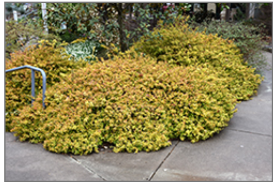
Kaleidoscope Abelia

Kaleidoscope Abelia will grow to be about 30 inches tall at maturity, with a spread of 4 feet. It tends to fill out right to the ground and therefore doesn't necessarily require facer plants in front. It grows at a slow rate, and under ideal conditions can be expected to live for approximately 30 years.