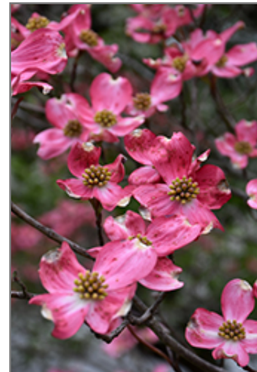
Cherokee Chief Flowering Dogwood flowers