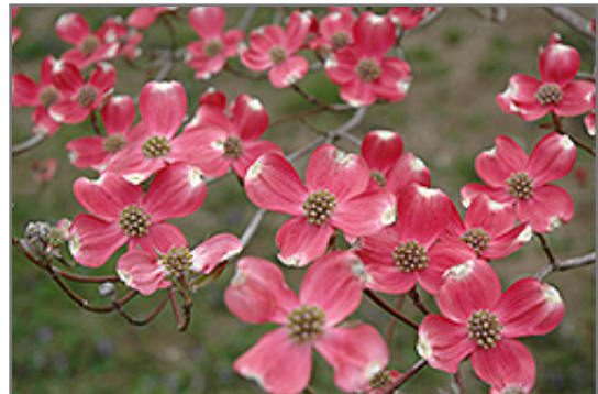
Cherokee Chief Flowering Dogwood flowers