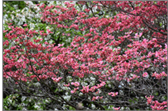
Cherokee Chief Flowering Dogwood flowers

This tree does best in full sun to partial shade. You may want to keep it away from hot, dry locations that receive direct afternoon sun or which get reflected sunlight, such as against the south side of a white wall. It requires an evenly moist well-drained soil for optimal growth, but will die in standing water. It is very fussy about its soil conditions and must have rich, acidic soils to ensure success, and is subject to chlorosis (yellowing) of the foliage in alkaline soils. It is quite intolerant of urban pollution, therefore inner city or urban streetside plantings are best avoided, and will benefit from being planted in a relatively sheltered location. Consider applying a thick mulch around the root zone in winter to protect it in exposed locations or colder microclimates. This is a selection of a native North American species.