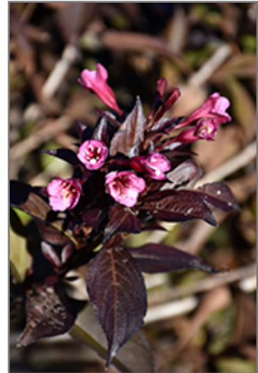
Fine Wine Weigela flowers