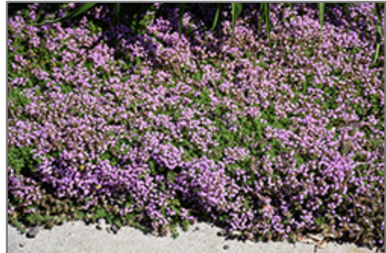
Elfin Creeping Thyme in bloom