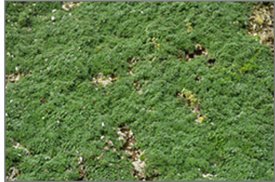
Elfin Creeping Thyme

This plant should only be grown in full sunlight. It prefers to grow in average to dry locations, and dislikes excessive moisture. It is considered to be drought-tolerant, and thus makes an ideal choice for a low-water garden or xeriscape application. It is not particular as to soil type or pH. It is highly tolerant of urban pollution and will even thrive in inner city environments. Consider covering it with a thick layer of mulch in winter to protect it in exposed locations or colder microclimates. This is a selected variety of a species not originally from North America. It can be propagated by division; however, as a cultivated variety, be aware that it may be subject to certain restrictions or prohibitions on propagation.