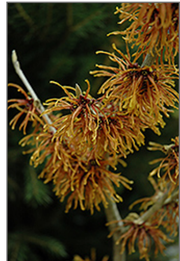
Jelena Witchhazel flowers

Jelena Witchhazel is recommended for the following landscape applications;