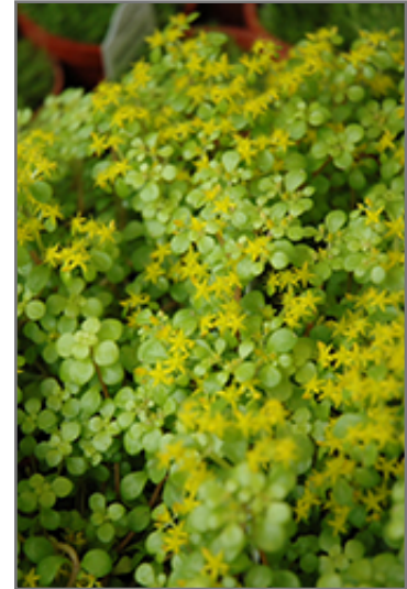
Golden Stonecrop flowers

This plant does best in full sun to partial shade. It prefers dry to average moisture levels with very well-drained soil, and will often die in standing water. It is considered to be drought-tolerant, and thus makes an ideal choice for a low-water garden or xeriscape application. It is not particular as to soil pH, but grows best in poor soils, and is able to handle environmental salt. It is highly tolerant of urban pollution and will even thrive in inner city environments. This is a selected variety of a species not originally from North America. It can be propagated by division; however, as a cultivated variety, be aware that it may be subject to certain restrictions or prohibitions on propagation.