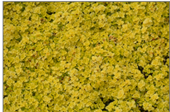
Golden Stonecrop foliage

Golden Stonecrop is recommended for the following landscape applications;