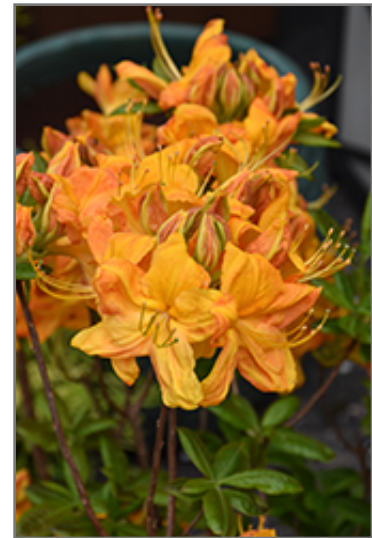
Klondyke Azalea flowers