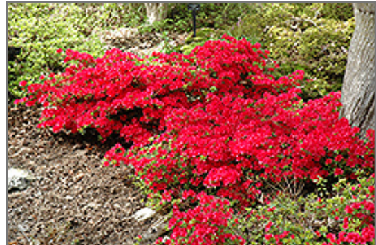
Hino Crimson Azalea in bloom