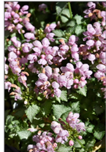
Pink Pewter Spotted Dead Nettle flowers

Pink Pewter Spotted Dead Nettle is recommended for the following landscape applications;