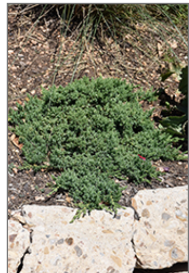
Green Mound Dwarf Japanese Juniper