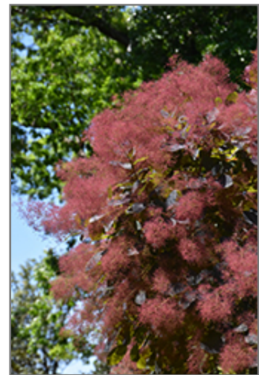
Grace Smokebush flowers