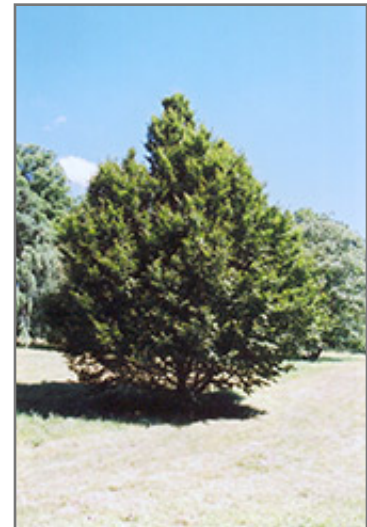
American Hornbeam