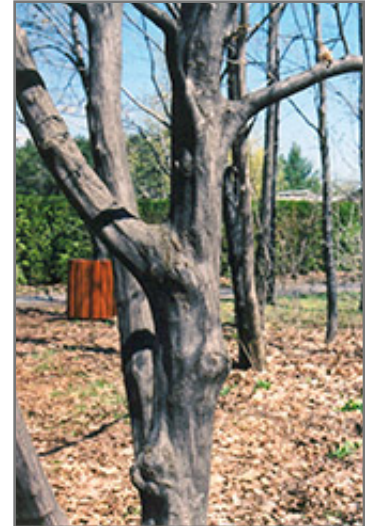
American Hornbeam bark

This tree performs well in both full sun and full shade. It is an amazingly adaptable plant, tolerating both dry conditions and even some standing water. It is not particular as to soil type or pH. It is somewhat tolerant of urban pollution. This species is native to parts of North America.