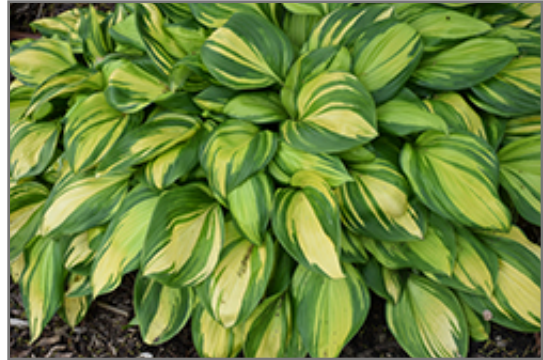
Rainbow's End Hosta

Rainbow's End Hosta will grow to be only 6 inches tall at maturity extending to 10 inches tall with the flowers, with a spread of 24 inches. When grown in masses or used as a bedding plant, individual plants should be spaced approximately 20 inches apart. Its foliage tends to remain low and dense right to the ground. It grows at a slow rate, and under ideal conditions can be expected to live for approximately 10 years. As an herbaceous perennial, this plant will usually die back to the crown each winter, and will regrow from the base each spring. Be careful not to disturb the crown in late winter when it may not be readily seen!