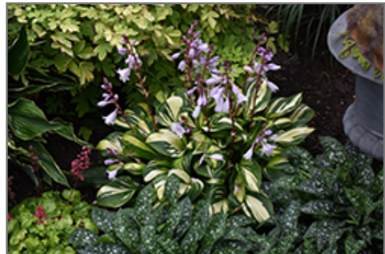
Rainbow's End Hosta in bloom