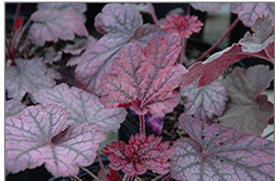
Midnight Bayou Coral Bells foliage

Midnight Bayou Coral Bells is recommended for the following landscape applications;