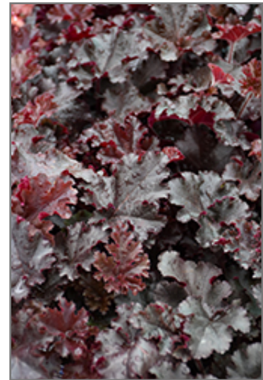
Melting Fire Coral Bells foliage

Melting Fire Coral Bells is a fine choice for the garden, but it is also a good selection for planting in outdoor pots and containers. It is often used as a 'filler' in the 'spiller-thriller-filler' container combination, providing a mass of flowers and foliage against which the larger thriller plants stand out. Note that when growing plants in outdoor containers and baskets, they may require more frequent waterings than they would in the yard or garden.