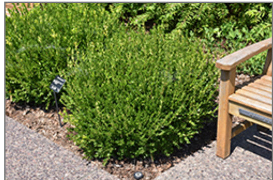
Wintergreen Boxwood