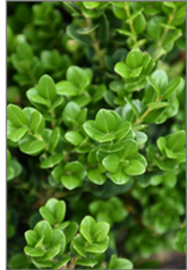
Wintergreen Boxwood foliage

Wintergreen Boxwood makes a fine choice for the outdoor landscape, but it is also well-suited for use in outdoor pots and containers. Because of its height, it is often used as a 'thriller' in the 'spiller-thriller-filler' container combination; plant it near the center of the pot, surrounded by smaller plants and those that spill over the edges. It is even sizeable enough that it can be grown alone in a suitable container. Note that when grown in a container, it may not perform exactly as indicated on the tag - this is to be expected. Also note that when growing plants in outdoor containers and baskets, they may require more frequent waterings than they would in the yard or garden.