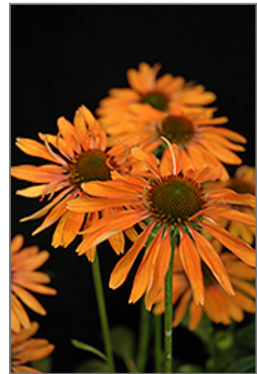
Hot Lava Coneflower flowers