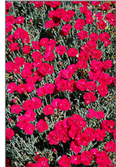
Frosty Fire Pinks flowers