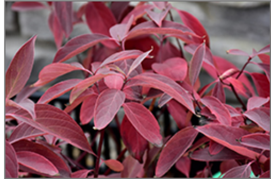
Arctic Fire Red Twig Dogwood in fall

This shrub does best in full sun to partial shade. It is an amazingly adaptable plant, tolerating both dry conditions and even some standing water. It is not particular as to soil type or pH. It is highly tolerant of urban pollution and will even thrive in inner city environments. This is a selection of a native North American species.