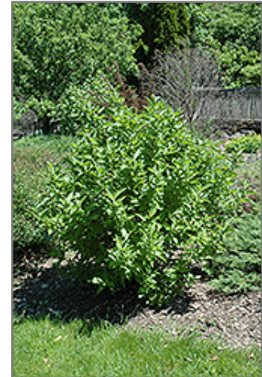
Arctic Fire Red Twig Dogwood