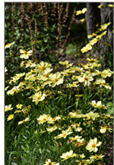
Full Moon Tickseed flowers