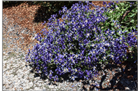
Sapphire Indigo Clematis in bloom