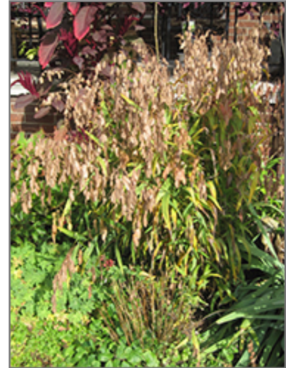
Northern Sea Oats

Northern Sea Oats is a fine choice for the garden, but it is also a good selection for planting in outdoor pots and containers. Because of its height, it is often used as a 'thriller' in the 'spiller-thriller-filler' container combination; plant it near the center of the pot, surrounded by smaller plants and those that spill over the edges. It is even sizeable enough that it can be grown alone in a suitable container. Note that when growing plants in outdoor containers and baskets, they may require more frequent waterings than they would in the yard or garden.