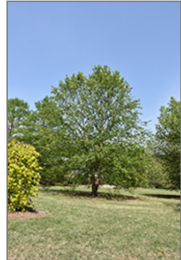
Dura Heat River Birch