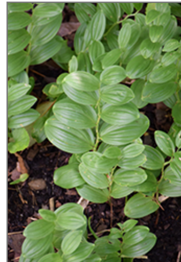
Solomon's Seal foliage