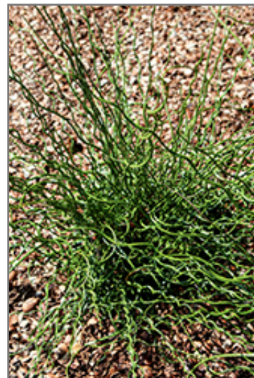
Curly Wurly Corkscrew Rush