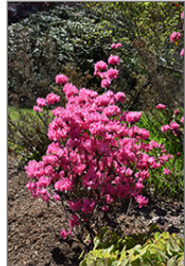
Landmark Rhododendron in bloom