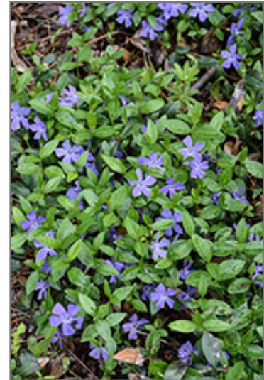
Common Periwinkle flowers