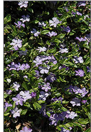
Common Periwinkle in bloom