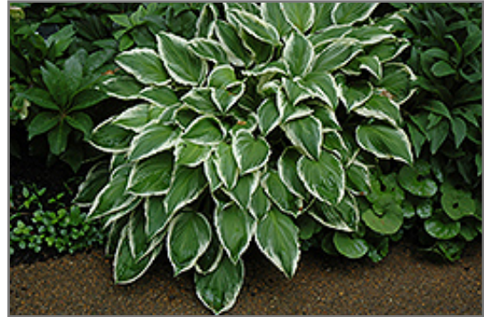
So Sweet Hosta

So Sweet Hosta will grow to be about 12 inches tall at maturity extending to 18 inches tall with the flowers, with a spread of 12 inches. When grown in masses or used as a bedding plant, individual plants should be spaced approximately 10 inches apart. Its foliage tends to remain dense right to the ground, not requiring facer plants in front. It grows at a medium rate, and under ideal conditions can be expected to live for approximately 10 years. As an herbaceous perennial, this plant will usually die back to the crown each winter, and will regrow from the base each spring. Be careful not to disturb the crown in late winter when it may not be readily seen!