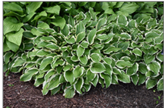
So Sweet Hosta