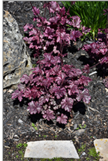
Midnight Rose Coral Bells