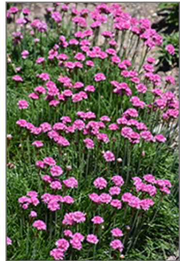
Bloodstone Sea Thrift in bloom

Bloodstone Sea Thrift is a fine choice for the garden, but it is also a good selection for planting in outdoor pots and containers. It is often used as a 'filler' in the 'spiller-thriller-filler' container combination, providing a mass of flowers against which the thriller plants stand out. Note that when growing plants in outdoor containers and baskets, they may require more frequent waterings than they would in the yard or garden.