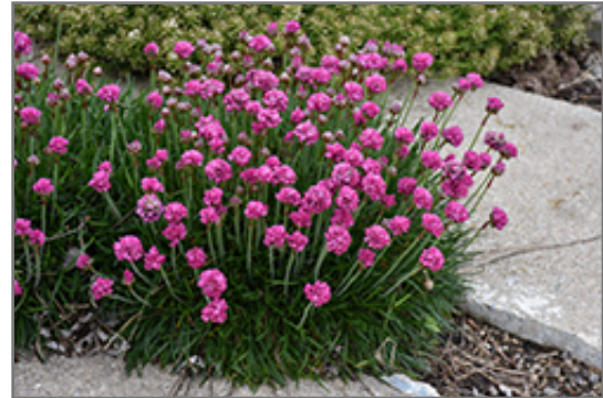
Bloodstone Sea Thrift in bloom