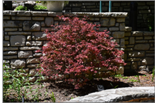
Shaina Japanese Maple

Shaina Japanese Maple is recommended for the following landscape applications;