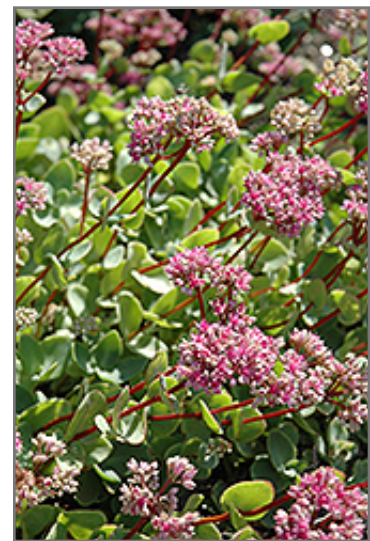
October Daphne flowers