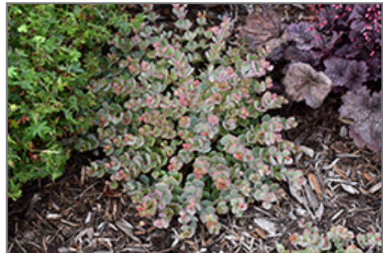
October Daphne