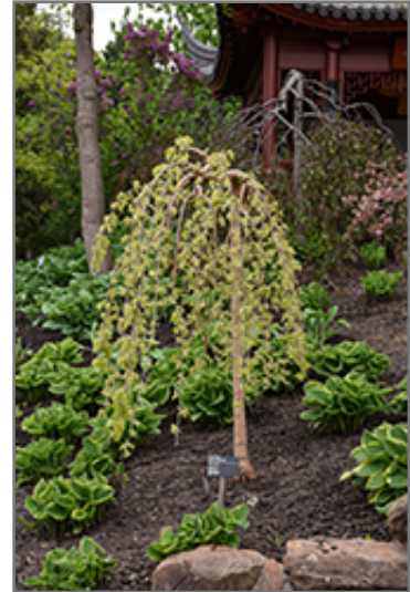
Chaparral Weeping Mulberry in bloom

This shrub performs well in both full sun and full shade. It is very adaptable to both dry and moist locations, and should do just fine under average home landscape conditions. It is considered to be drought-tolerant, and thus makes an ideal choice for xeriscaping or the moisture-conserving landscape. It is not particular as to soil type or pH, and is able to handle environmental salt. It is highly tolerant of urban pollution and will even thrive in inner city environments. This is a selected variety of a species not originally from North America.