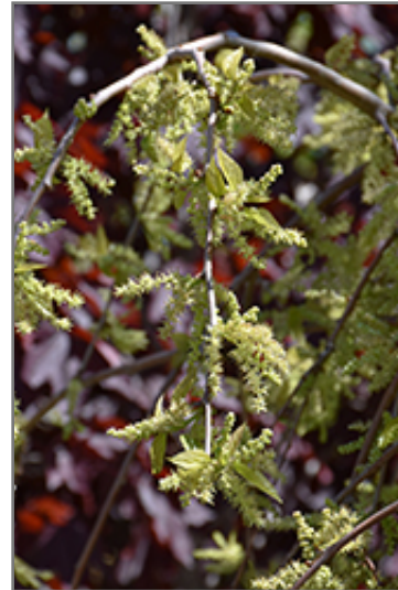
Chaparral Weeping Mulberry flowers