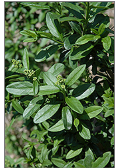
California Privet foliage

California Privet will grow to be about 10 feet tall at maturity, with a spread of 10 feet. It has a low canopy with a typical clearance of 1 foot from the ground, and is suitable for planting under power lines. It grows at a fast rate, and under ideal conditions can be expected to live for approximately 30 years.