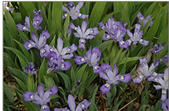
Dwarf Crested Iris flowers