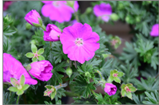
Max Frei Cranesbill flowers

Max Frei Cranesbill will grow to be about 8 inches tall at maturity, with a spread of 12 inches. When grown in masses or used as a bedding plant, individual plants should be spaced approximately 10 inches apart. Its foliage tends to remain low and dense right to the ground. It grows at a medium rate, and under ideal conditions can be expected to live for approximately 10 years. As an herbaceous perennial, this plant will usually die back to the crown each winter, and will regrow from the base each spring. Be careful not to disturb the crown in late winter when it may not be readily seen!