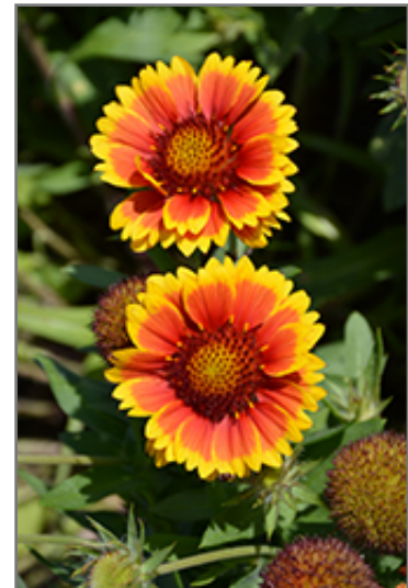
Arizona Sun Blanket Flower flowers

Arizona Sun Blanket Flower is recommended for the following landscape applications;