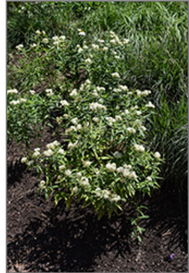
Ice Ballet Milkweed in bloom

This plant does best in full sun to partial shade. It is quite adaptable, preferring to grow in average to wet conditions, and will even tolerate some standing water. It is not particular as to soil type or pH. It is quite intolerant of urban pollution, therefore inner city or urban streetside plantings are best avoided. This is a selection of a native North American species. It can be propagated by division; however, as a cultivated variety, be aware that it may be subject to certain restrictions or prohibitions on propagation.