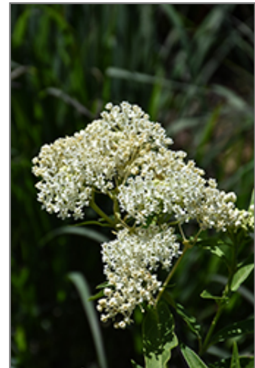
Ice Ballet Milkweed flowers