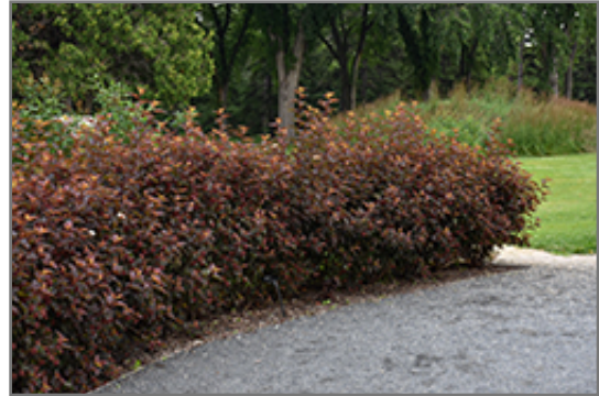
Center Glow Ninebark

This shrub does best in full sun to partial shade. It is very adaptable to both dry and moist locations, and should do just fine under average home landscape conditions. It is not particular as to soil type or pH. It is highly tolerant of urban pollution and will even thrive in inner city environments. This is a selection of a native North American species.