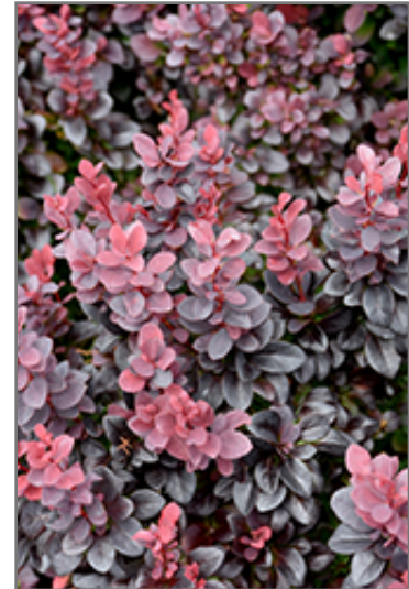
Concorde Japanese Barberry foliage