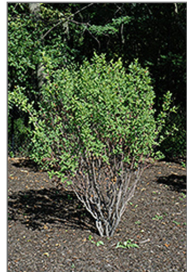
Rainbow Pillar Serviceberry

Rainbow Pillar Serviceberry is recommended for the following landscape applications;